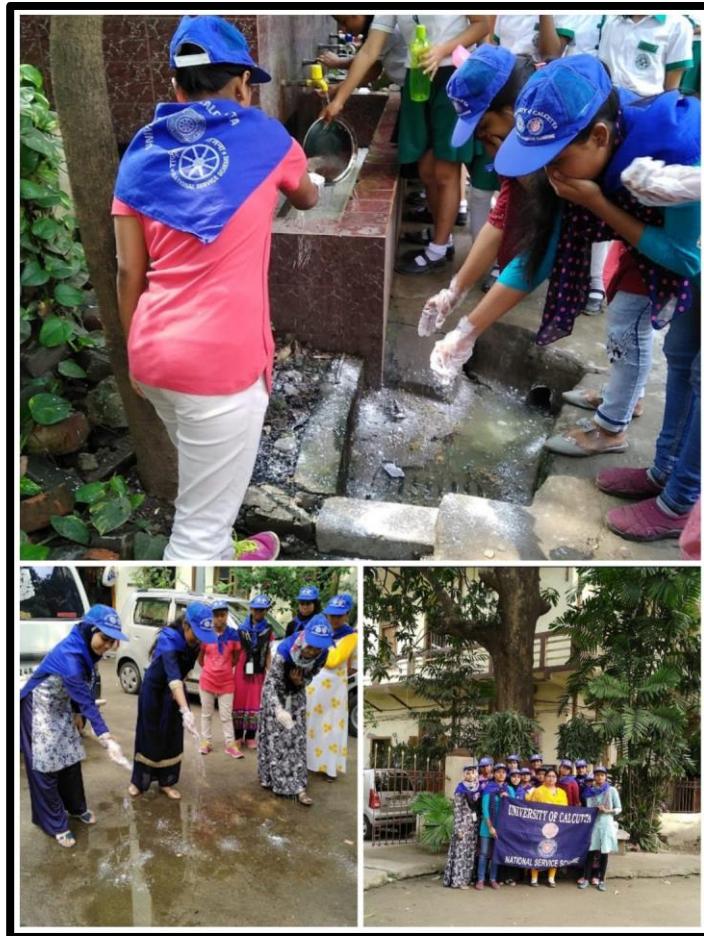
CAMPUS CLEANING DRIVE