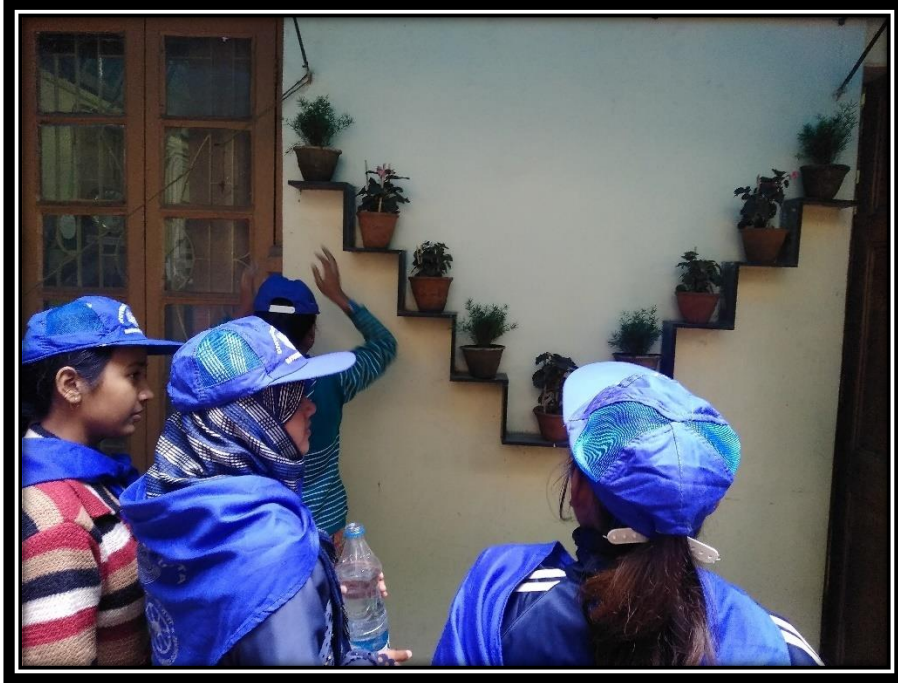
DECORATING THE FRONT WALL OF PRINCIPAL'S OFFICE BY NSS VOLUNTEERS