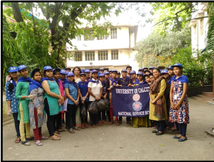
NSS VOLUNTEERS MEETING WITH PRINCIPAL AND PROGRAMME OFFICER OVER FUTURE PROGRAMMES