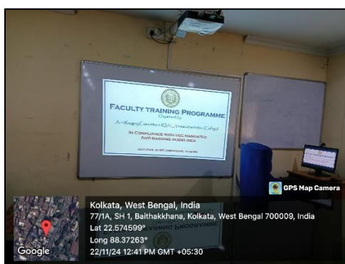
Faculty Training Programme

The session was followed by a robust interactive session where many doubts were raised by the faculty and duly resolved.