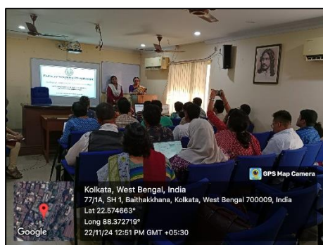
Principal addressing on the necessity of training and self-updating