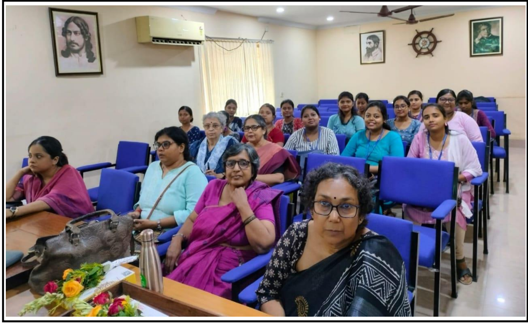
The audience comprising of the faculties of English department, Bengali department and Sanskrit department, VIC and the students during the event