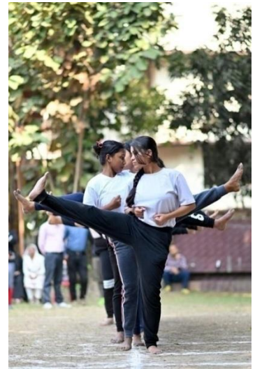
Karate Team with their Instructor)