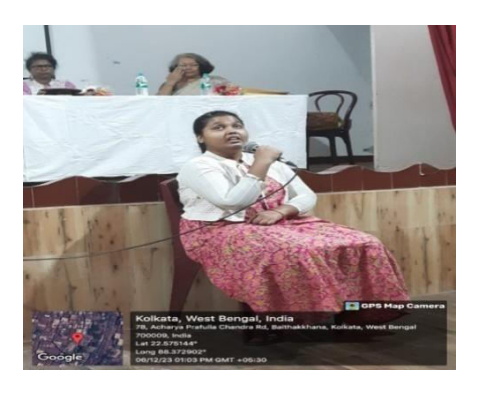
Experience shared by a student having multiple disability