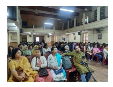
Students along with the members of DAF