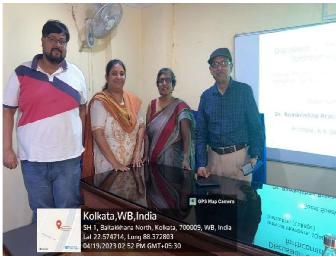
On the occasion of signing the MoU among the two institutions