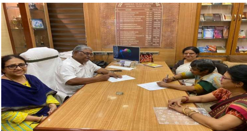
On the occasion of signing the MoU with the two institutions