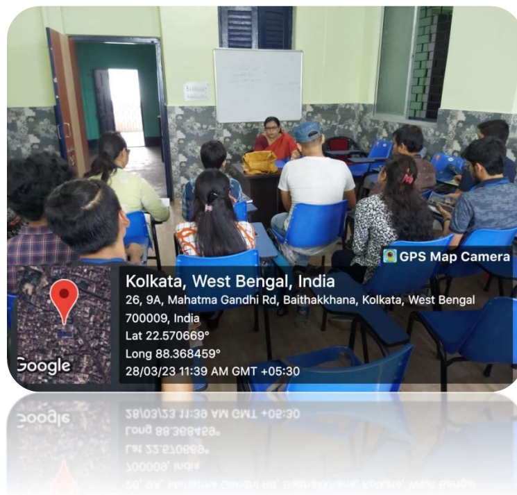
Lecture delivery and interactive session