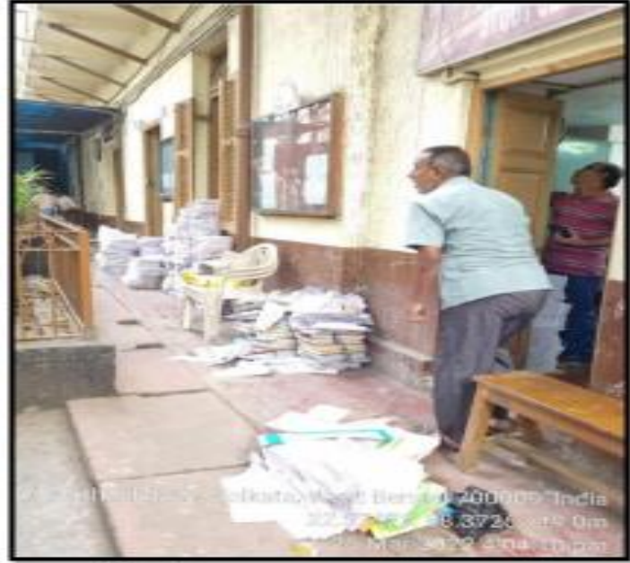
Waste disposal to Recycling Agency