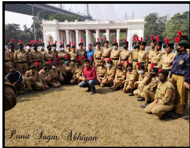
Swachh Bharat Abhiyan and Punit Sagar Abhiyaan, NCC Cadet participating in awareness drive.