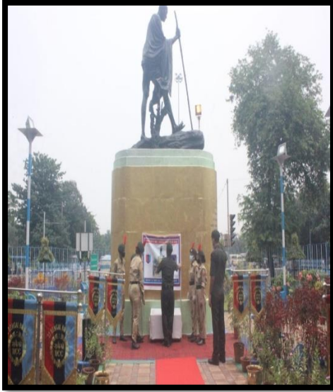
NCC Cadets paying homage to the statue of mahatma Gandhi by cleaning the statue.