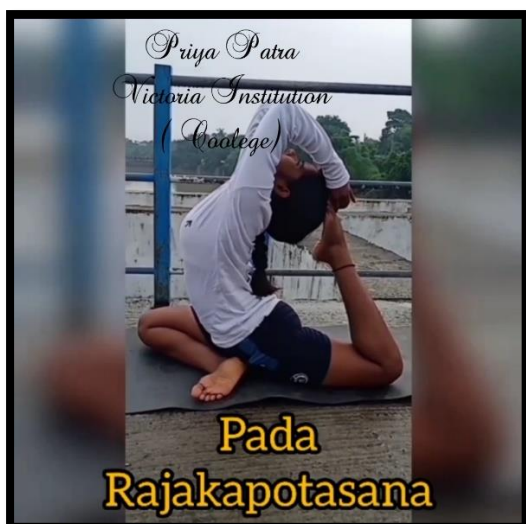
NCC Cadet participating in online yoga practice on International Yoga Day