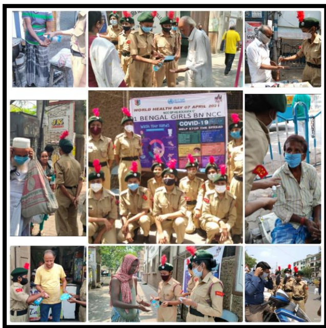
A collage on World Health Day

order to combat and contain the contamination of this deadly virus.